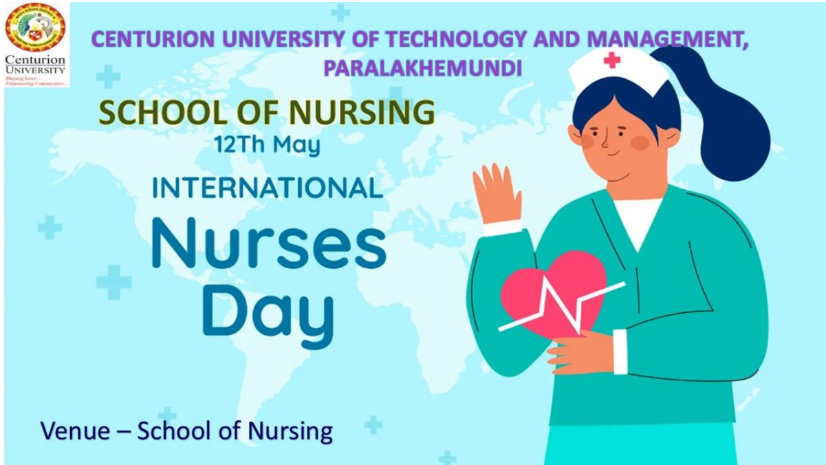
Banner for the event: International Nurses Day at CUTM Paralakhemundi